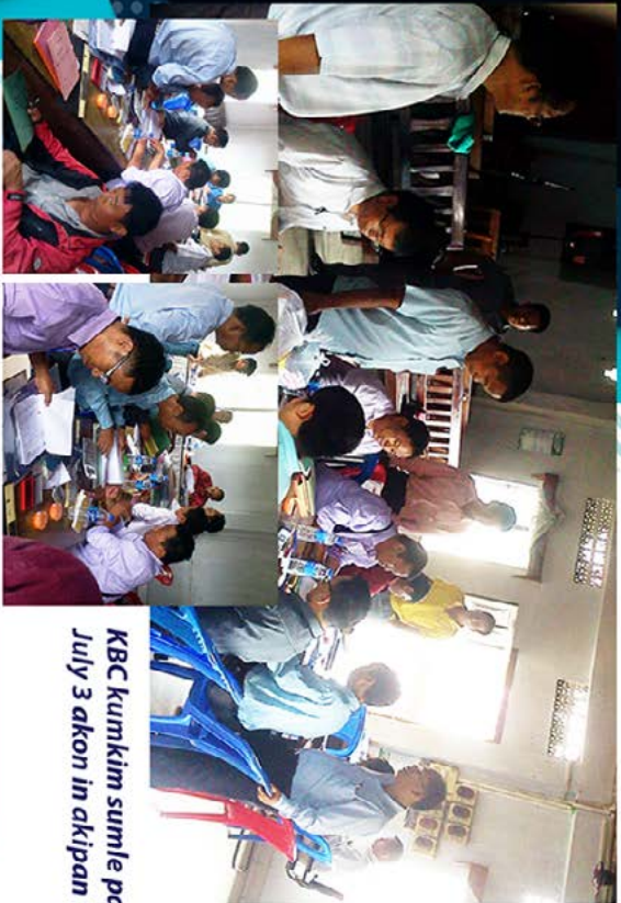
KBC kumkim sumle pai vetchilina (Audi) July 3 akon in akipan tai.