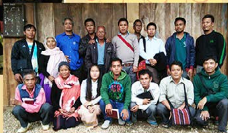
Pate nikho molphei Gambih No. 12