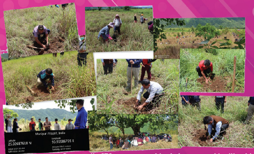
Devt. noija STS compoun a thingkeh tuna agakineijin ahi.