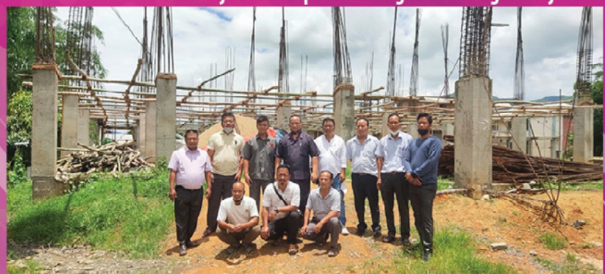
Finance and Property in Tuibong Centre Church kisa jing lai vetlhahna aganei.