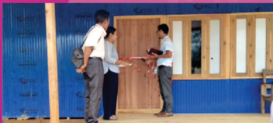
Sarang tampak guest house ana kithenso ta