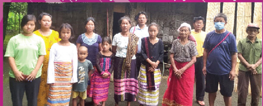
M&E program noija kigong Mission Field Bekhuliang a Fasting prayer ana kibol.