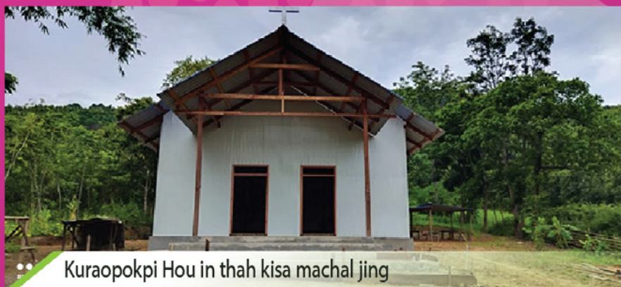
Kuraopokpi Hou in thah kisa machal jing