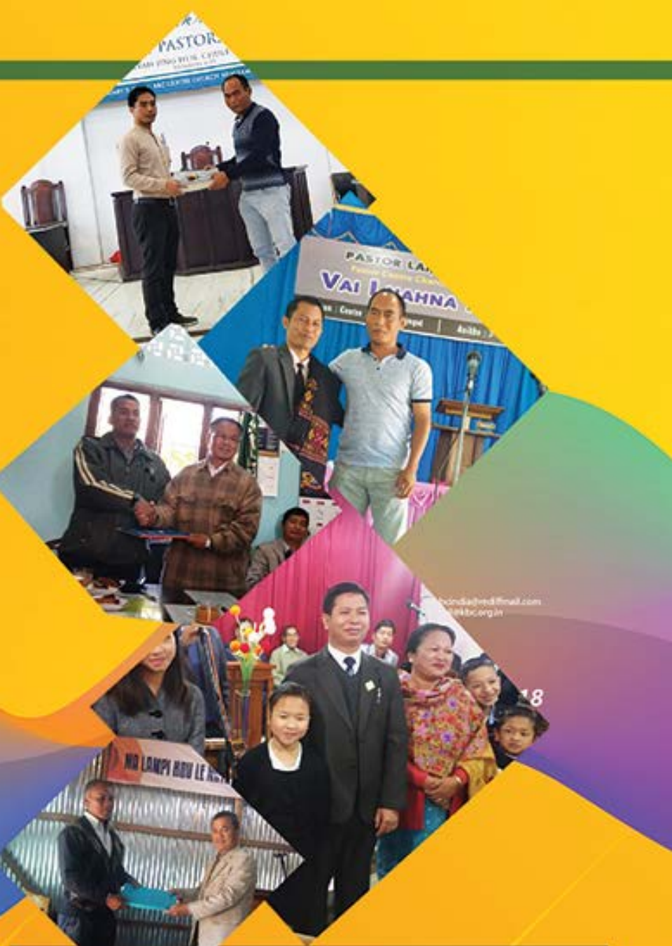
Pastor transfer and posting cheho Houbung hotoh kilhanna le kikhutsanna